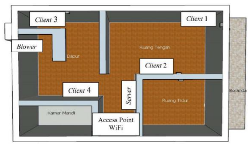
Fig. 1. Controller positions

This research focuses on home security, comforts, and energy efficiency. The testbed consists of 5 NodeMCU ESP-12E, 1 for server and 4 for clients. The first client is used to monitor and control the home door. The second client is used to monitor and control the state of lamp in the living room. The third client is used to monitor and control the gas, blower is activated when the controller detects the gas level threshold. The fourth client is used to monitor and control the state of lamp in the home terrace. The positions of each controller are depicted in Fig 1.