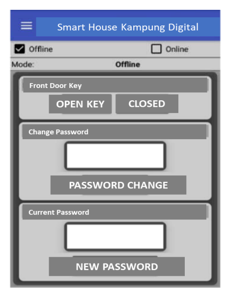
Fig. 4. Management access menu