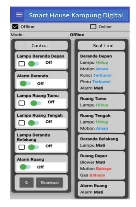
Fig. 3. Mobile app monitor and control system

Fig 3 shows the status of terrace, its monitor the status of terrace lamp, door lock, motion, and alarm status. The monitor the lamp status in the living room and back home terrace. The status of gas leakage in the kitchen is also monitored by system and triggered alarm if the gas leakage is above the threshold. The mobile application also provide menu to control the lamp in each room. Figure 4 shows the management menu to change the access password to mobile application. It is also providing door lock control system to control the door lock from remote area.